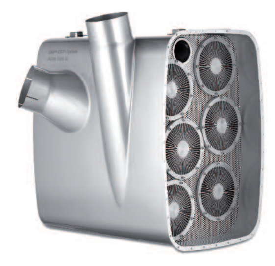
SMF® system for Commercial Vehicles

Put your trust in the SMF® when retrofitting your vehicles and benefit from our many years of experience in the business. Throughout Europe, thousands of trucks have already been successfully retrofitted with HJS particulate filters. All systems meet the statutory requirements and are certified in accordance with the valid licensing regulations, such as Annex XXVII in Germany and VERT in Switzerland, and are approved in Denmark, Italy, the Netherlands, the UK and the USA.